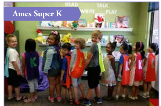
Ames Super K

“Thank you so much! This program definitely helped my kindergartener!!”