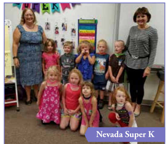
Nevada Super K

“I loved the newsletters! They provided good information on what my daughter was doing which helped spark questions for me to ask her.”