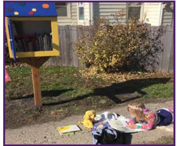
A very special LFL in Ames.

To ensure our libraries are meeting the needs of the community, a QR code with our web page address will be attached to those new or replacement libraries. The QR code enables the public to provide comments, offer suggestions, ask questions, let us know if books