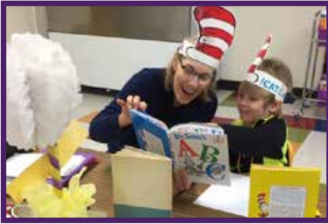
ACPC Reading Buddies