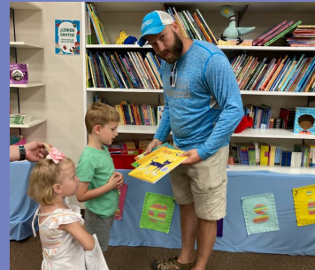
Children at Play Pages choose new books to take home!