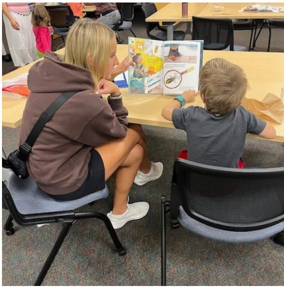
Story Pals discussing and reading together at Northwood Preschool in Ames