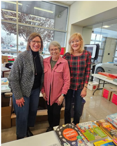
Volunteer "book elves" at the Salvation Army Angel Tree Toy Shop, December 2024, in Ames

https://www.raising-readers.org/volunteers/volunteer-opportunities