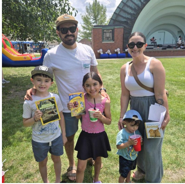
A family of readers