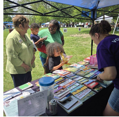
Choosing books at the Raising Readers table