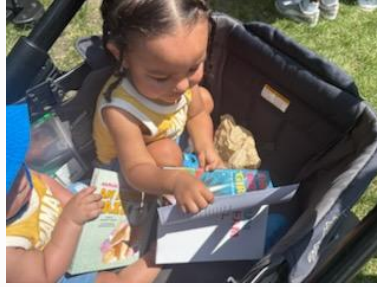
Books for our youngest friends