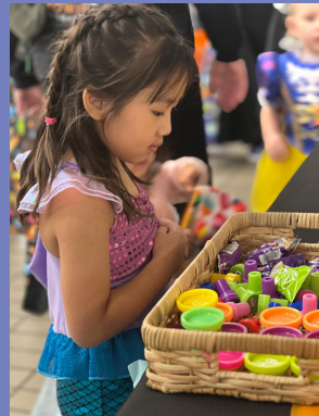
Children and families enjoyed the fun and festivity of Malloween held on October 29 at North Grand Mall.

***** If you'd like to explore other contribution options more in line with planned or recurrent giving, please send us an email. We are happy to discuss our full menu of donation opportunities with you. *****