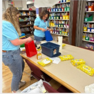
Day of Caring