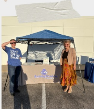
LSI Car Seat Event