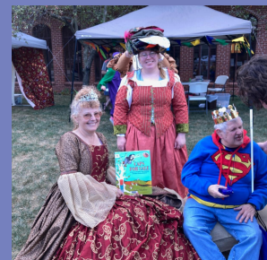
Raising Readers volunteers had the opportunity to dress up and entertain community